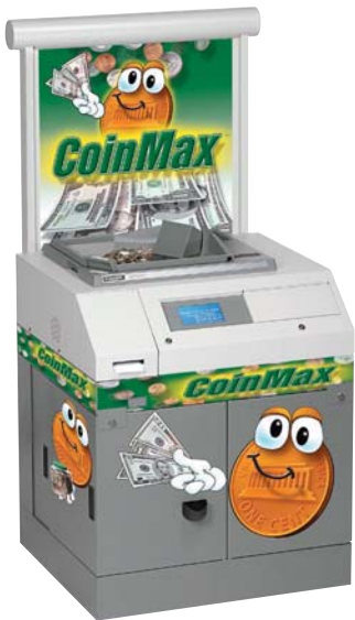
Optional height adjustable CoinMax sign with cabinet graphics.