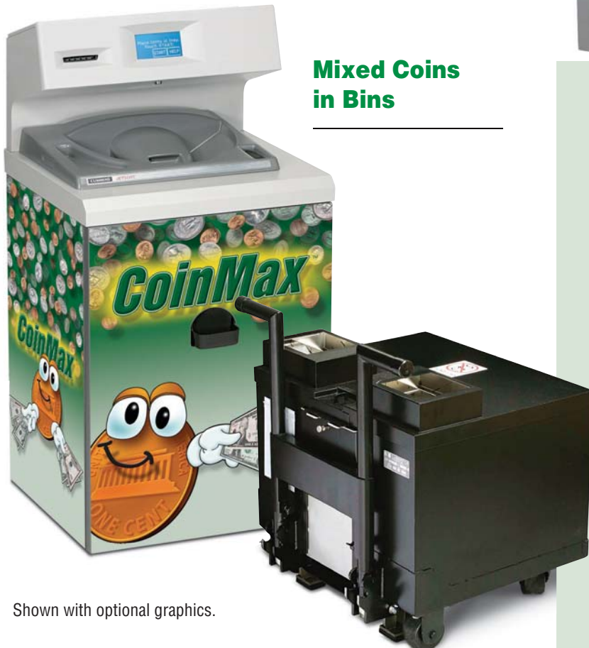
Mixed Coins in Bins

All units can be used with either cloth bags or plastic bags.