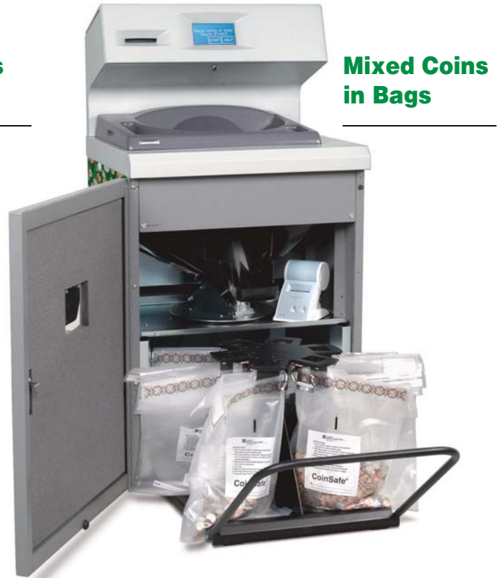
Mixed Coins in Bags

All units can be used with either cloth bags or plastic bags.