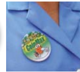
CoinMax™ merchandising items

your store, while floor graphics and easel signs promote inside your store.