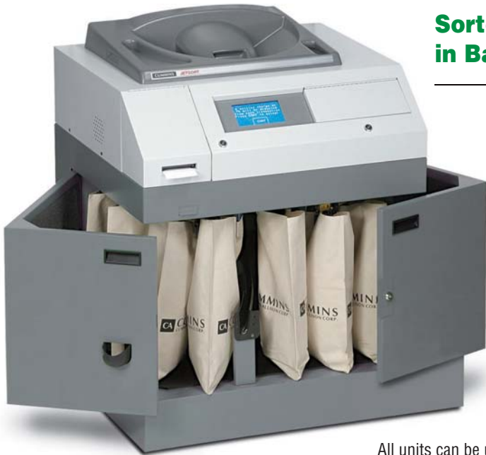
Sorted Coins in Bags